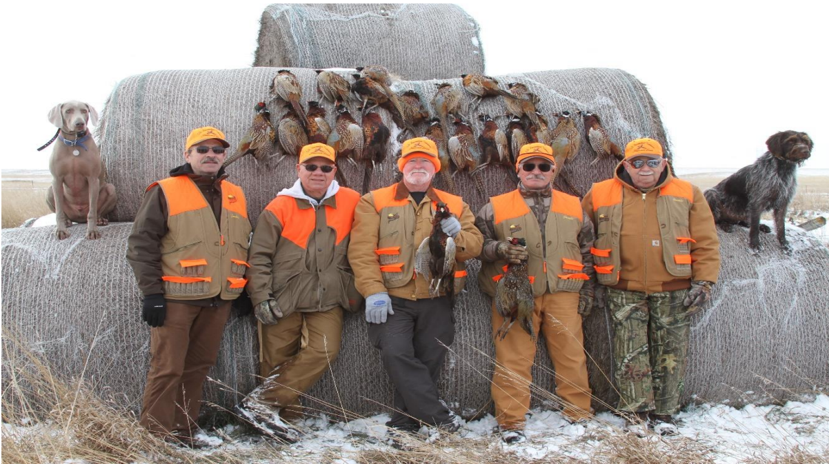
2019 Decorated Veteran Pheasant Hunters

VFW Post 8530 Gettysburg SD will host our 5 th annual Pheasant Hunt Nov. 7 th – Nov. 11 th 2020. In 2019 National VFW provided approximately 1/3 of the total cost. National VFW has cut funding for the Pheasant Hunt. We were allowed an application in the VFW Magazine. Post 8530 members voted to continue the Pheasant Hunt regardless. As a result, we will be asking our comrades through out the State of South Dakota for their very much appreciated support in selling raffle tickets.